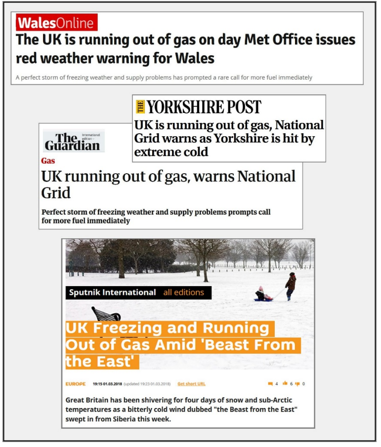
Fig. 1 - Selected headlines 1 March 2018

This is a part of National Grid's explanation of GDW: